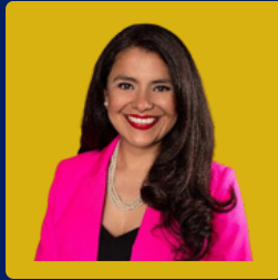
Montserrat Garibay OELA USDE